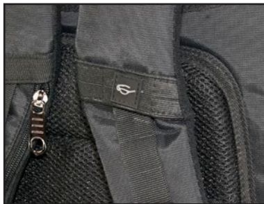
Holder for glasses on lefter shoulder strap