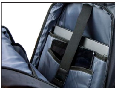
Padded pockets for laptop and tablet in the main compartment