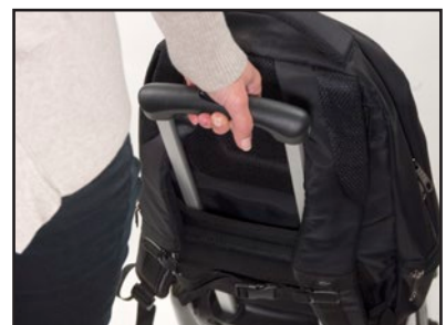
Trolley mount at the back