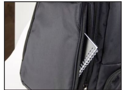
Pocket with side opening for quick access