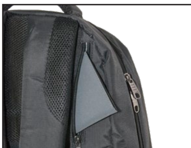
Security pocket on the back