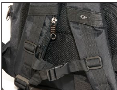
Adjustable chest strap and waist strap