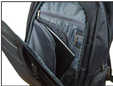
Stay organized with lots of pockets