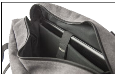
Huvudficka med foder och vadderat datorfack