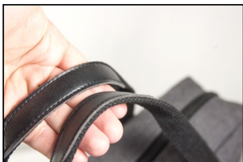
Snygga konstläder-detalljer på bärhandtagen